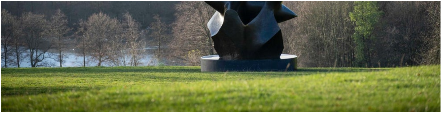
Yorkshire Sculpture Park offers a combination of artworks and the great outdoors

There are around 100 works to encounter. One of the best things about seeing sculpture outdoors is the way it changes with the seasons, weather and light. Winter is the perfect time for a walk around our 500 acres of beautiful, historic landscape.