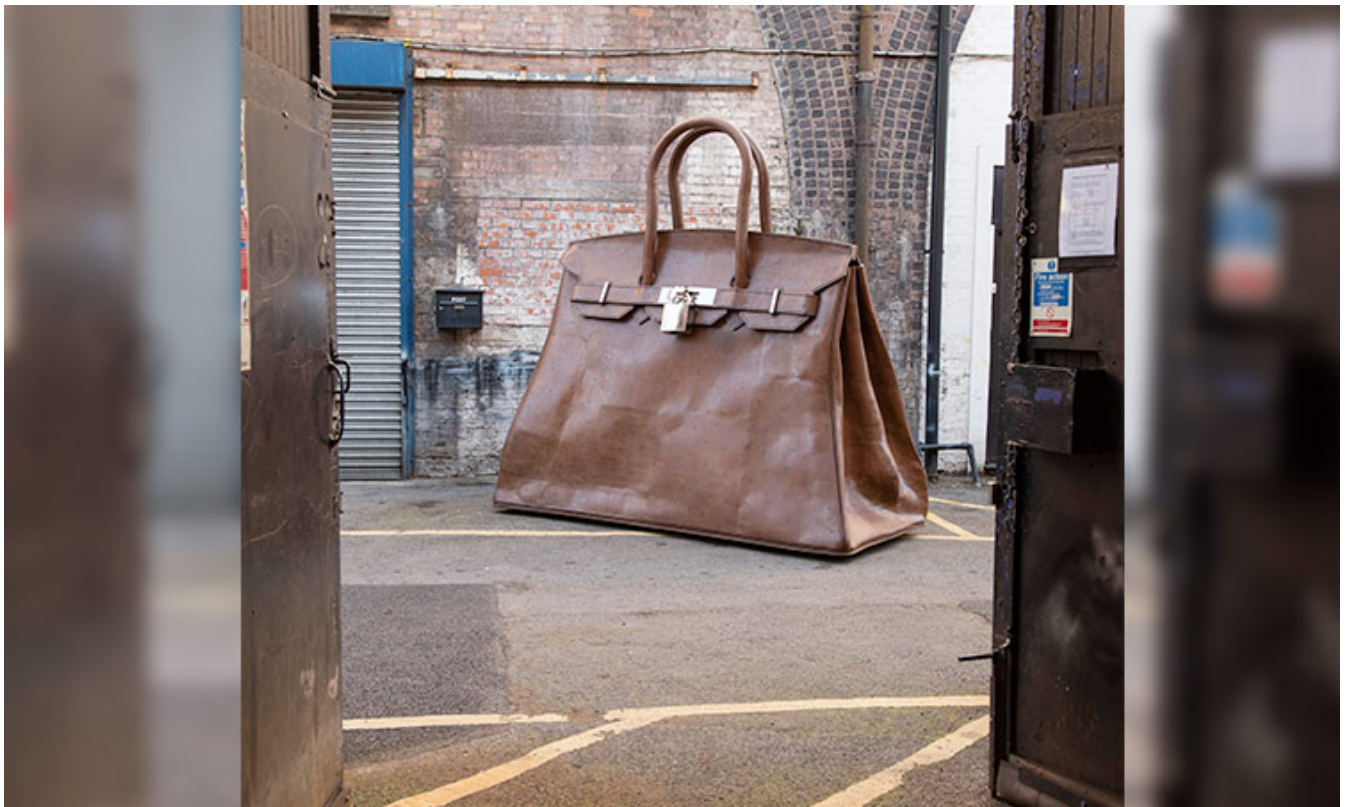
Kalliopi Lemos' composition titled Bag of Aspirations.