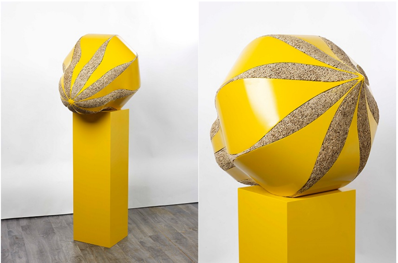
Kalliopi Lemos – In Balance, Yellow, Courtesy of the artist and photographer Rowan Durrant

Gazelli Art House continues its practice of presenting a wide range of international artists, featuring a broad and critically acclaimed program of exhibitions. This time, they are introducing the first solo exhibition by the Greek-born, London-based sculptor, painter and installation artist – Kalliopi Lemos. The versatile artist is known for her site-specific installations which are usually created with a narrative concerning with human rights ( https://www.widewalls.ch/art-for-rights-campaign/ ). The show, entitled In Balance , will feature both new and old works, produced in a variety of different mediums. The artworks display a unique examination of day-to-day struggles, and the pursuit of personal freedom and, ultimately, self-fulfillment.