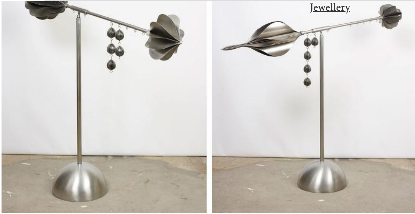
Pictured: Stainless Steel Sculptures , 2016.

Latest Architecture Design Art Travel Lifestyle Fashion Watches Handmade Bespoke Subscribe & Jewellery